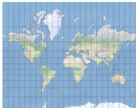
Useful (but deceptive) Mercator Projection

Not knowing how many countries exist today, folks have yet to agree on how many continents exist!